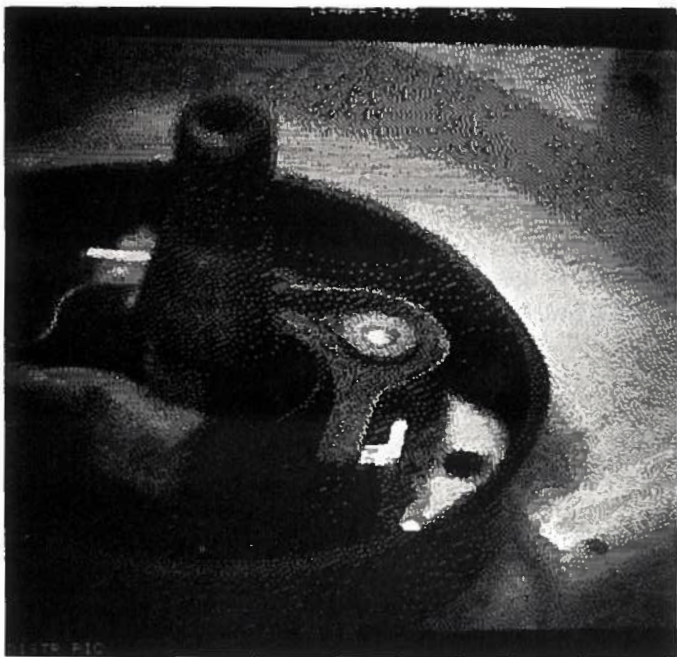
Fig. 5 A Distributor, TV image 540 x 410 pels

Another problem resulting from the history effect is what we call the "knight's move" problem. As the algorithm advances across a region of low desired brightness, the error introduced by not lighting pels gradually builds up, until a pel is lit and the error reduced. Unfortunately, because error is diffused, no matter what the state of things was at the boundary of the region, as the algorithm advances, pels along a line at some orientation tend to have the same modified desired brightness. When a pel is lit, its near neighbors are made less likely to be lit, but as Figure 1 shows there is neither direct nor indirect feedback to the pel a knight's move away (marked K). Thus, it too tends to be lit, and the algorithm tends to give lines of lit points at this knight's move orientation. This is visible in Figure 5 in the darker areas.