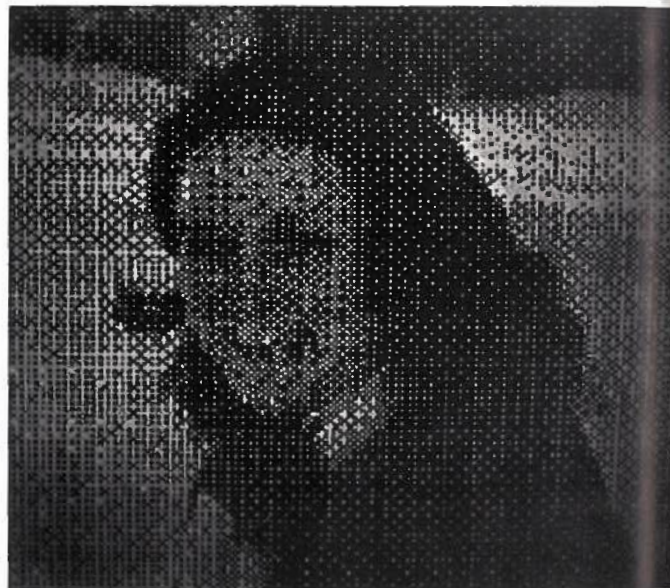
Fig. 6 Ordered Dither, using 8x8 matrix, on same data as Figure 4.

Despite these problems, error diffusion gives better results than other available methods. In particular, it is better than ordered dither 2 in that it has better resolution in areas of low contrast, and has less distracting texture. Figure 6 is the same picture as Figure 4, processed with ordered