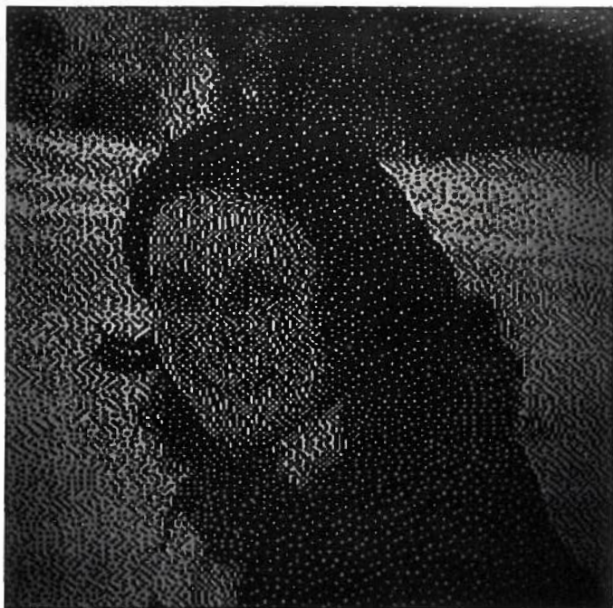
Fig. 4 TV image, 288 x 216 pels

izes. Crystals start to grow at many points. When two crystals grow into each other, they cannot merge, because their patterns of atoms (their crystal structures) have different orientations. The region where two crystals meet is called a grain boundary. When the error diffusion method is working on a region of fairly uniform desired brightness it can be thought of as a crystal growing process, where each successive line has bright pels laid down in a pattern determined by the influence of those of the previous line. The pattern can start out different in different parts of the region, and where the different patterns meet, the change in texture is often quite visible. This is most apparent in Figure 5, at the top, both just above the central post of the distributor and at the extreme right.